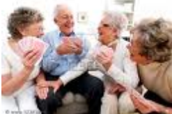
Gathering together for some afternoon fun!