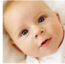
Early steps to a Godly life!

Cradle Roll An early step toward a Godly life is our focus for our Cradle Roll program for children from birth to 3 year olds. Parent's are provided with materials and resources on how to provide a God centered home for their families. When they reach 3 years of age they are invited to attend the Sunday School program.