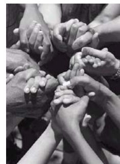
“Building a Family of Followers”

These classes are designed to teach newcomers about the basics of the Christian faith from a distinctively Lutheran perspective. This 10 week course will cover such topics as, "The Bible", "The Ten Commandments", "Holy Baptism", "Holy Communion" and more. While many will take this class toward membership, the most important thing is developing a life-long love and pattern of worshipping Christ. Friends who are already members of another LCMS congregation are to contact their home church and request a "Letter of Transfer" to St. Paul. They are then encouraged (but not required) to take Pastor's Adult Information Class for refreshment through the Word and relationship building. Please call the church office, 248-541-0613 to for further information.