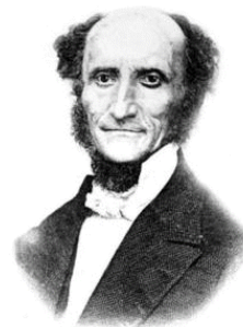
C. F. W. Walther, First President of the LC-MS